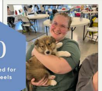
bring on the puppies!