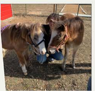
our new mini horses!