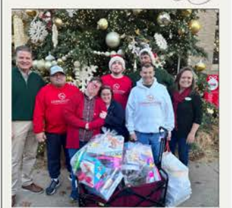
toys for tots