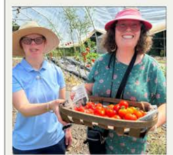
enjoying a spring day in the garden